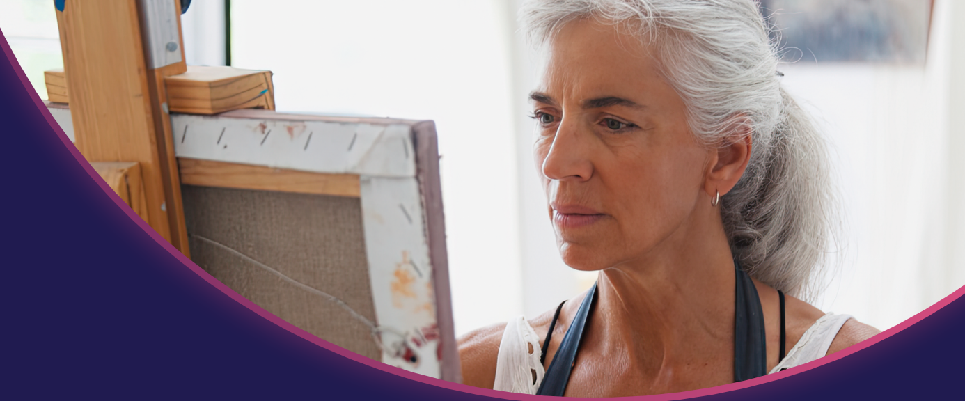
Not an actual patient.